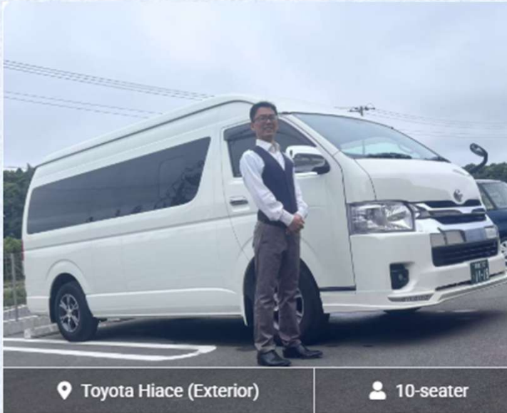
📍 Toyota Hiace (Exterior)